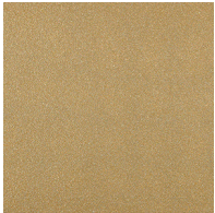
Jazz Gold - 29